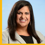
Aleece Burgio Barclay Damon LLP Buffalo, NY